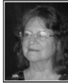
Patricia A. McKillip